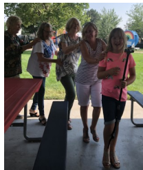
2021 TULLY PARK PICNIC