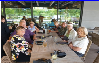
Lunch at Coyne Restaurant after walking. June 2021