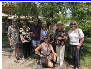
Wandergruppe June 2021